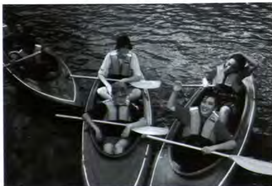
Year 7 Peer support camp

Very few of us knew each other and this seemed to add to the sense of occasion. It felt a little strange as we all filed into the hall. I remember the exact time that we all knew we had arrived. It was when the Principal said "Welcome Fortians". A short time later we combined and bonded together to form the Year Seven of 2002.