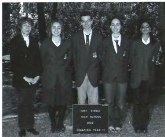
Debating Year 11