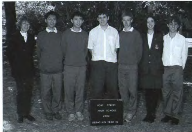
Debating Year 10