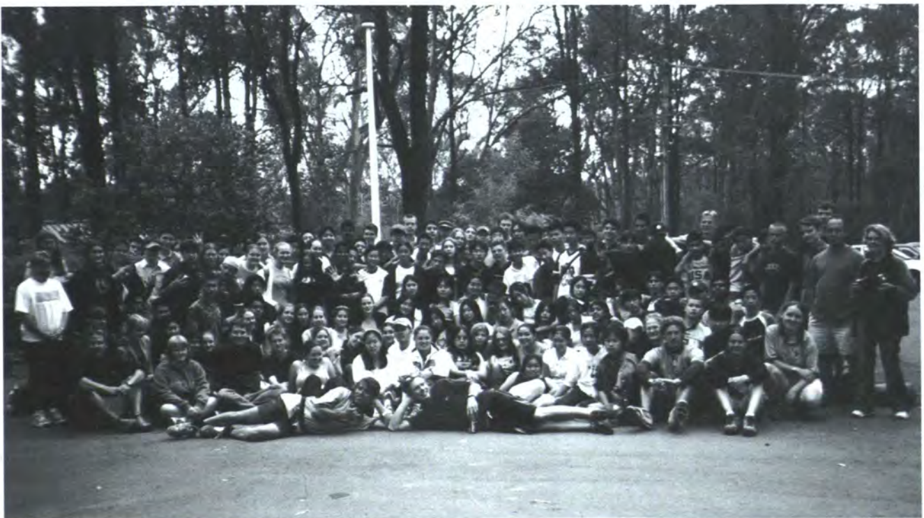
Year 9 camp