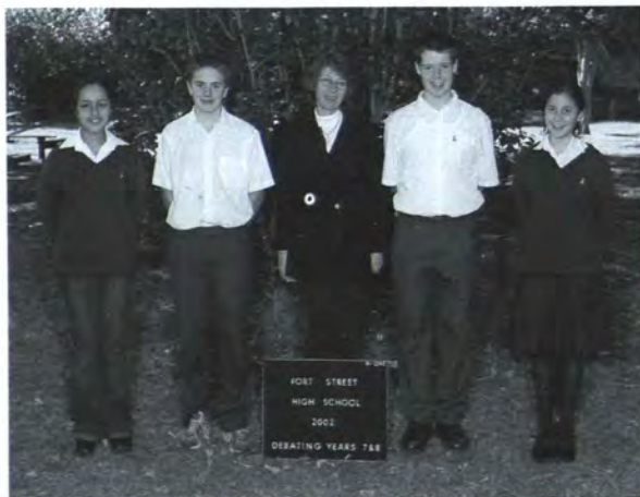
Debating Years 7 & 8