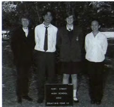
Debating Year 12