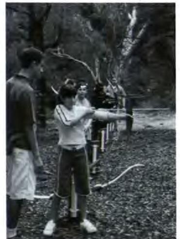
Year 7 camp Vision Valley