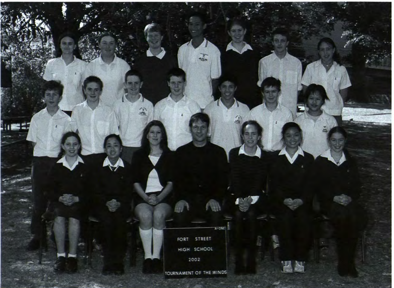
Tournament of the Mind