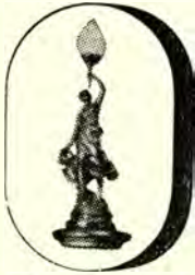
The Flame of Worthy Purpose

M.B.C. training will equip you for interesting, rewarding and lucrative positions. M.B.C. students have a reputation for efficiency and reliability in Australia and overseas.