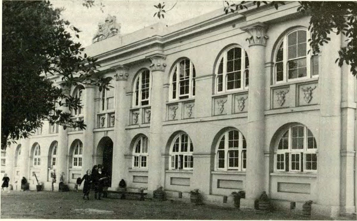
FORT STREET GIRLS' HIGH SCHOOL.