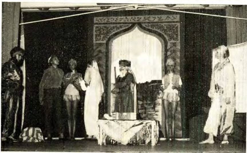
SCENE FROM "THE POETASTERS OF ISPAHAN".