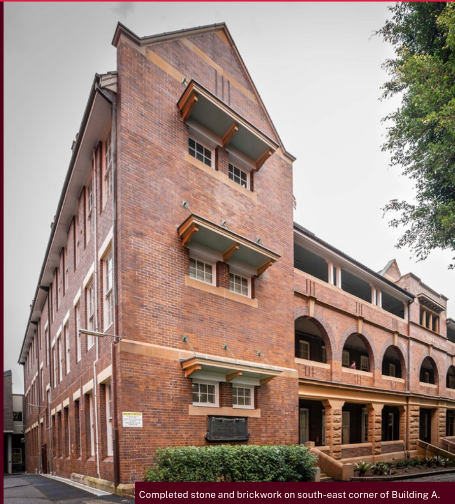
Completed stone and brickwork on south-east corner of Building A.