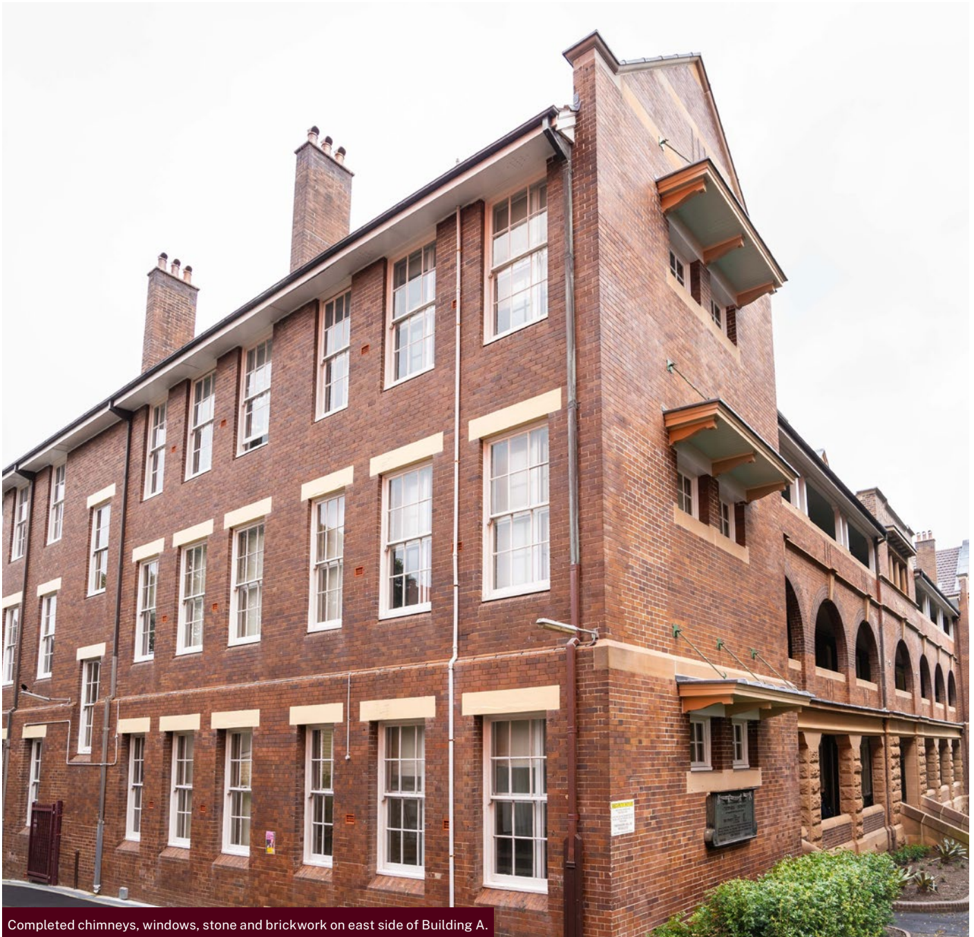
Completed chimneys, windows, stone and brickwork on east side of Building A.