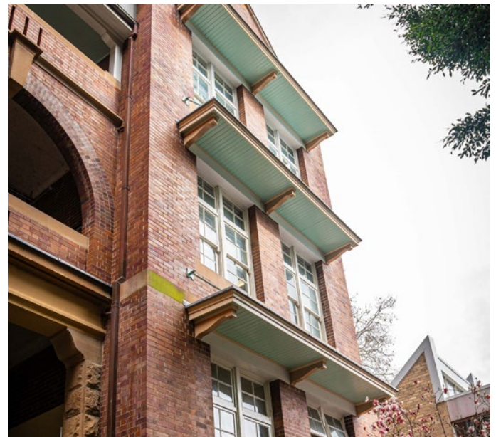
Completed front façades of Building A including stone and brickwork.